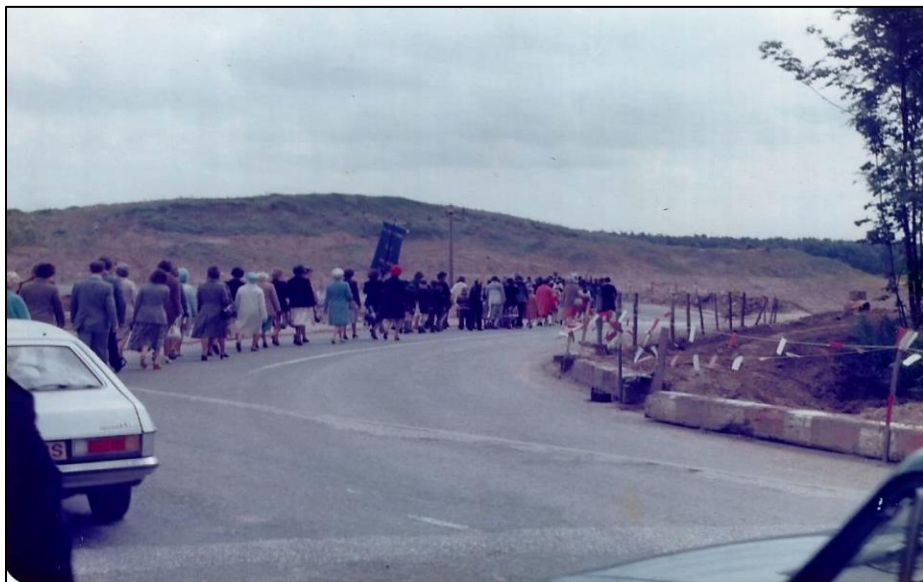
Church Witness Walkers take a detour, through the temporary Bickerstaffe hills.

the hoard of Roman Coins discovered at the same site in the 19th Century. Following on, it stated, 'Little Hall Croft appears to be a 17th Century Burial Place, but will be cut off by the Motorway, furthermore, unexplained aerial features should be looked for, where the Motorway crosses Ash Field and Little Kiln Hey, as it may reveal evidence of early industrial activity. Quite recently, a layer of Coal-Ash was observed when foundations were being laid for a bungalow in Church Road.' The report also stated, 'The extraction of sand, by Pilkington Bros, in the Bickerstaffe section, may have contaminated any archaeological evidence'.