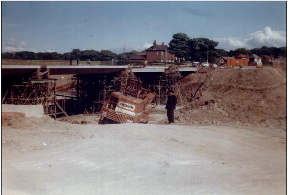
Coal Merchant, William Taylor, stands by the detour road.

asked other interested parties to join the team. Each section of the Motorway Route was allocated to an individual Field-Worker, who organised groups to walk and look for anything of interest, also to research documentary evidence of the area.