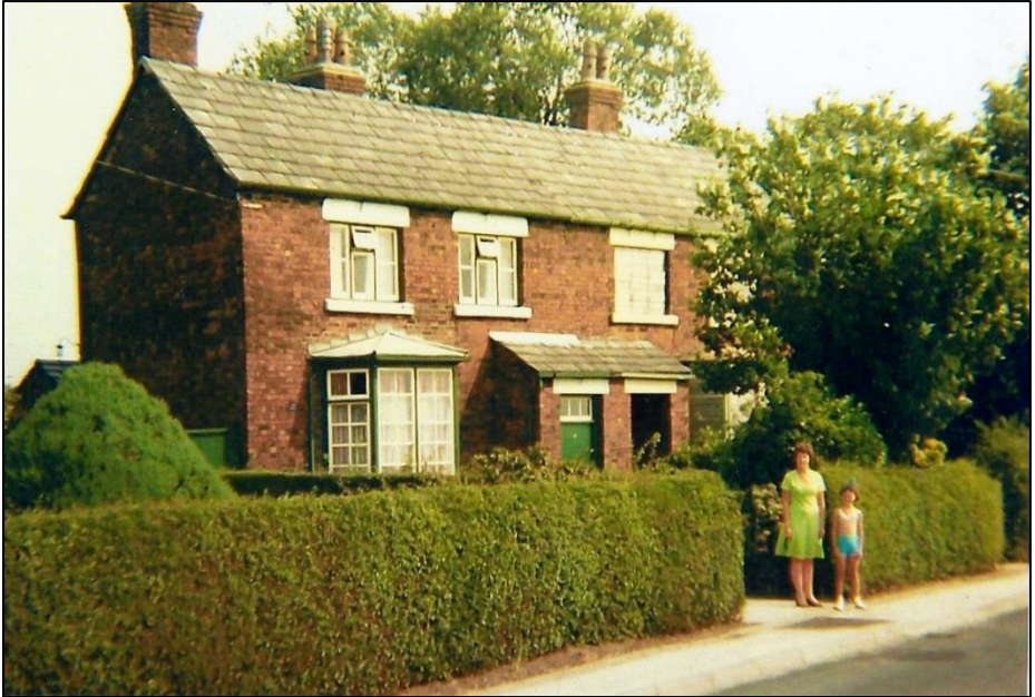
Two of the houses on Church Road, in the path of the Motorway.